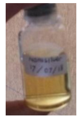
Figure 1 : Colloidal Nanosilver Concentration of 0.01 M.

The process of preparation of nanosilver was 0.01 M carried out by adding drop wise sodium citrate solution to AgNOsolution<sub>3</sub> which was heated at 100°C. Then stirring for 1 hour and formed brownish-yellow solution as shown in Fig. 1.